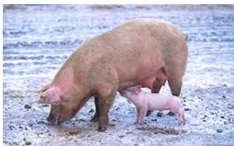
Domestic pigs ( Sus scrofa )